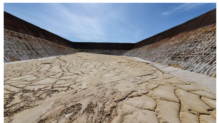
AVONBANK TEST PIT SLOPE & TAILINGS STUDIES