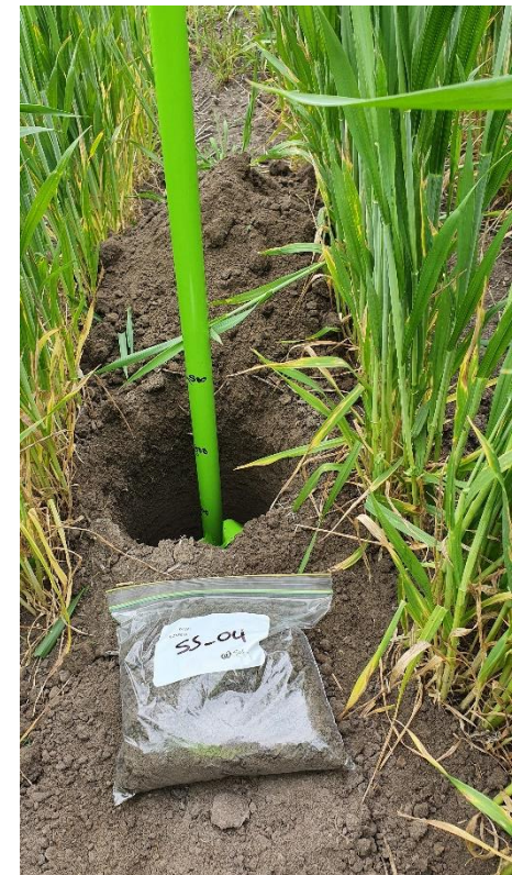
SOIL CHARACTERISATION STUDIES CONTINUE