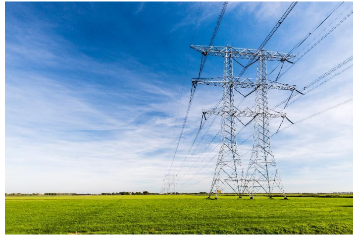
POWER SUPPLY STUDIES ARE UNDERWAY

The test pit studies are continuing as planned, with important information gathered regarding the tailing’s consolidation, groundwater, and pit slope stability, providing a strong foundation to design the full scale proposed mine.