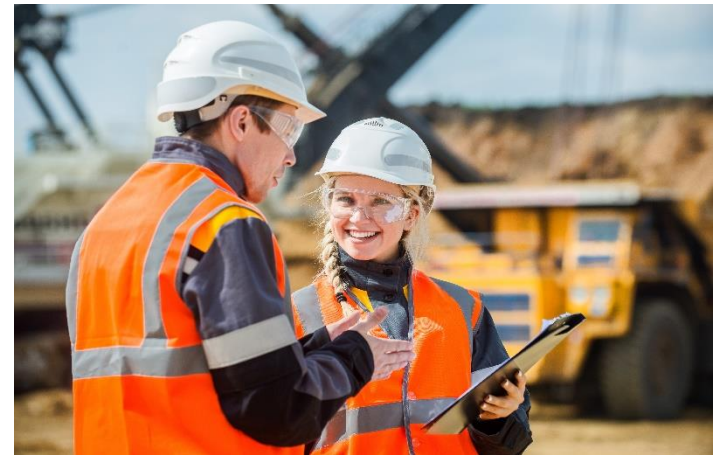
WORK FORCE STUDIES ARE UNDERWAY