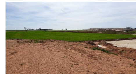
TEST PIT STATUS