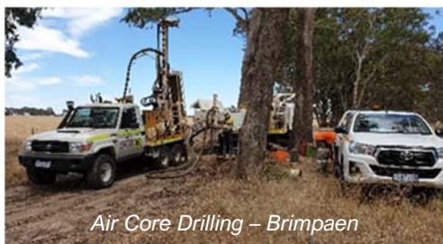
Air Core Drilling – Brimpaen