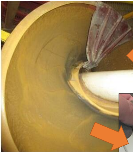
Above: Wet gravity (spiral) separation