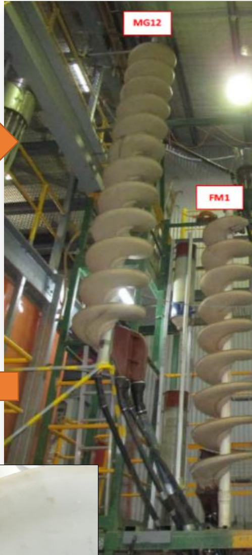
Above: Full scale-spirals