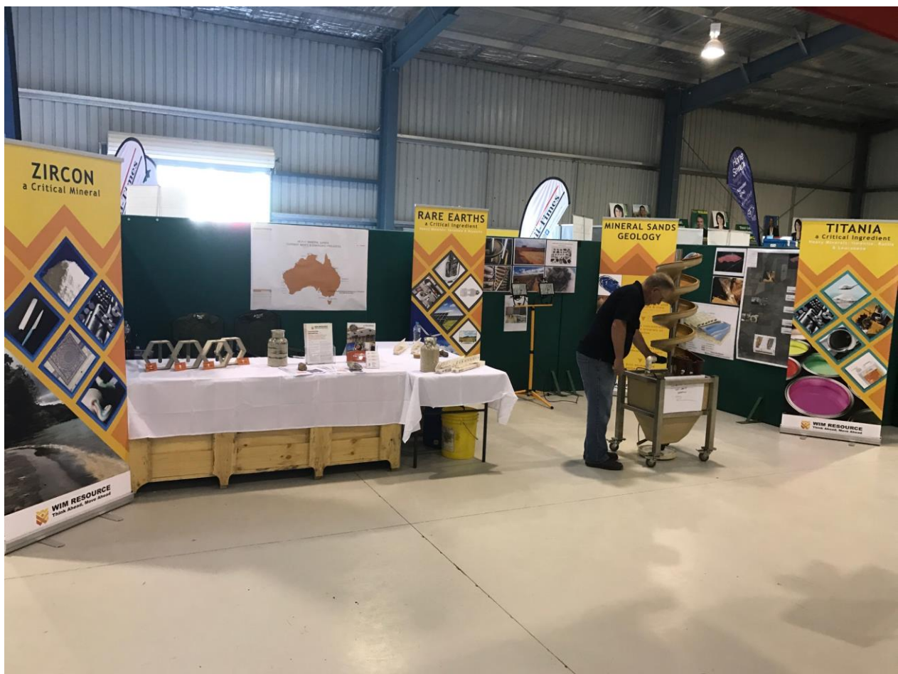
Above: WIM Resource interactive exhibit at WFD 2017