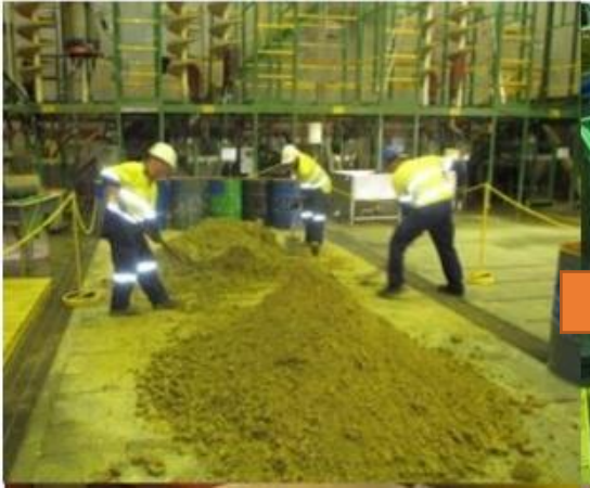
Above: 20 tonne bulk sample - Avonbank

WIM engaged world-leading experts Mineral Technologies Ltd to develop a process flow sheet for separating the valuable heavy minerals from a 20 tonne sample of Avonbank ore. This test work was successful in producing Heavy Mineral Concentrate (HMC).