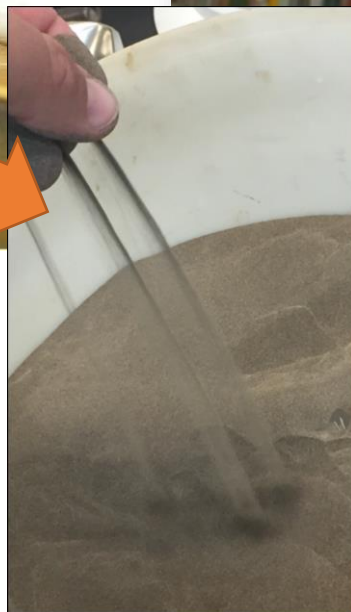
RHS: Final Product for export (HMC)